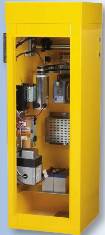
BGU-D Full-time DC powered battery backup