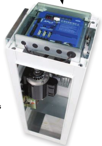
Model BGU top view