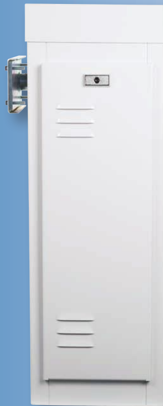
BGU 115 VAC