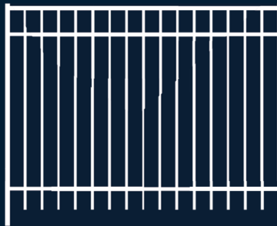
SERIES 2 FLAT TOP

Heights available: 48" 60" Color: black only